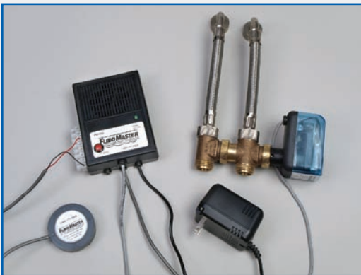
Available with wireless sensor, model FM-190

FloodMaster's FM-090 can prevent extensive water damage when a washing machine, particularly one in an upstairs laundry room or apartment, fails.