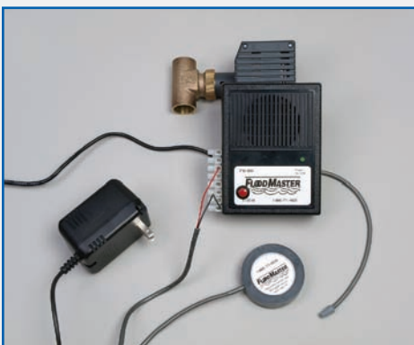
Available with wireless sensor, model FM-194

The FM-094 from FloodMaster is designed to minimize water damage when a hot water heater or water tank failure occurs. 3/4" sweated valve is standard. 3/4" or 1" threaded valves are also available.